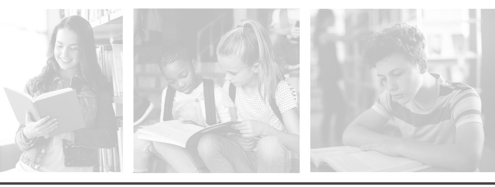
Figure: 19 TAC §74.28(c)